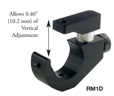
Please refer to our website for complete models and drawings.

RM1D Clearance Hole for #8 (M4) Screws RM1E Tapped Mounting Hole for #8-32 (M4 x 0.7)