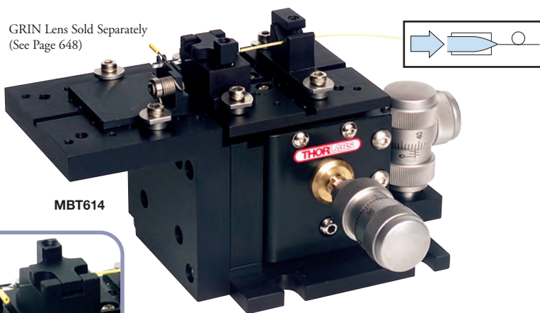
GRIN Lens Sold Separately (See Page 648)