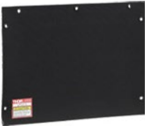
LPCE15 For 15" x 12" Enclosure Side