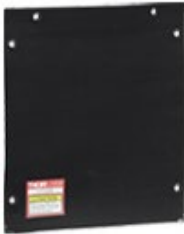
LPCE9 For 9" x 12" Enclosure Side