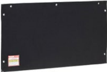
LPCE21 For 21" x 12" Enclosure Side