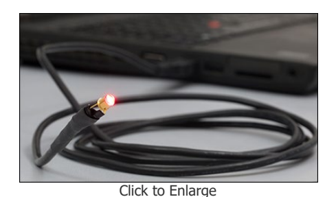
A LED630L being powered by the USB port in a laptop.

A Universal Serial Bus (USB) port can be used to quickly power many of the Light Emitting Diodes (LEDs) on this page for temporary use. USB ports are used in a variety of applications like charging batteries and transferring data; they are commonly found on computers, but they are increasingly found on other electronic devices, and even incorporated into wall outlets. This tab presents a step-by-step tutorial to take advantage of this port in order to power an LED. Take note of the spec sheet for the LED being used; if its Typical Forward Voltage is listed higher than 5 V, the LED will not be able to be powered by a USB port (this is explained using Equation 2 below). Spec sheets can be downloaded by clicking on the (