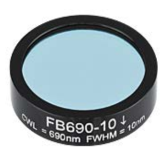
FB690-10 Ø1" Filter CWL = 690 nm, FWHM =