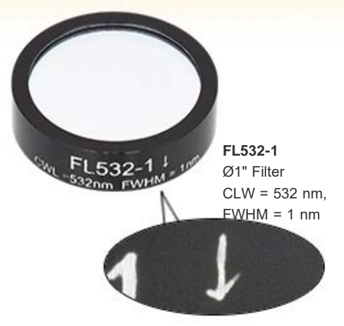
Transmission Direction Indicator