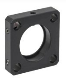
CP35 Double Bore for Ø1" Optics