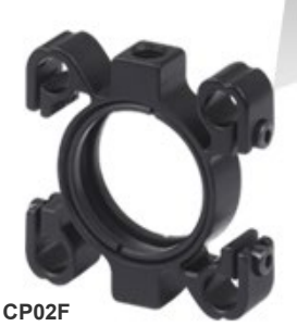
SM1-Threaded Dual Flexure Cage Plate

The CP02F Cage Plate's flexure arm automatically compensates for cage rod misalignment to prevent cage plate binding.