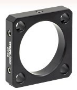
CP36 Ø1.2" Double Bore for SM1 Lens Tubes

The CP02F Cage Plate's flexure arm automatically compensates for cage rod misalignment to prevent cage plate binding.