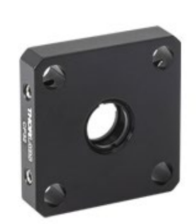
CP32 Internal SM05 Threads