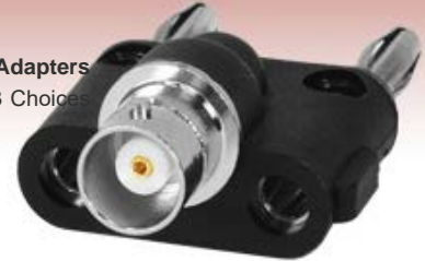
Banana Adapters 3 Choices