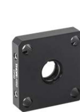
CP32 Internal SM05 Threads