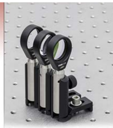
PH2ET Allows for Closely Mounted Optical Components