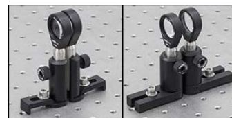
Click to Enlarge Close-Approach Post Holders can Mount Ø1/2" Posts in Contact, while Posts Mounted in Standard Post Holders are Separated by a Minimum of 0.48" (12.2 mm)

Close-Approach Post Holders are designed for use on congested optical tables or when multiple components need to be placed in close proximity to each other. These post holders feature a cutaway design that provides two lines of contact for stable mounting, enables the same height adjustment of a standard post holder, and allows two Ø1/2" posts to be positioned very closely, or even in direct contact with each other, as shown in the image to right. They can be secured to the table using CL8 table clamps (sold below) and are compatible with all Ø12 mm, Ø12.7 mm, and Ø1/2" optical posts. Each imperial (metric) post holder comes with a TS25H 3/16" (TS6H/M 5 mm) hex spring-loaded thumbscrew.