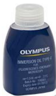
MOIL-30 Olympus Type F Immersion Oil