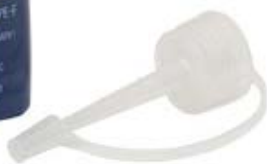
MOIL-30NF2 Nikon Type NF2 Immersion Oil