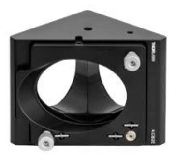
KCB2E Holds 2" Elliptical Optics