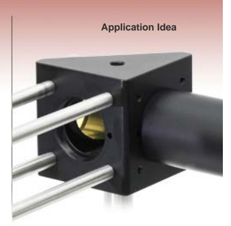
Elliptical Mirror Mounts are Cage System and Lens Tube Compatible