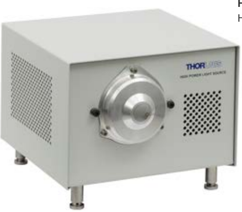
HPLS-30-04 High Power Light Source