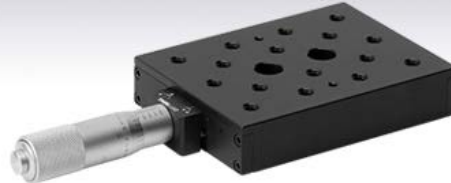
The PT1 Translation Stage Utilizes 150-811ST