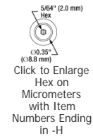
Click to Enlarge Hex on Micrometers with Item Numbers Ending in -H