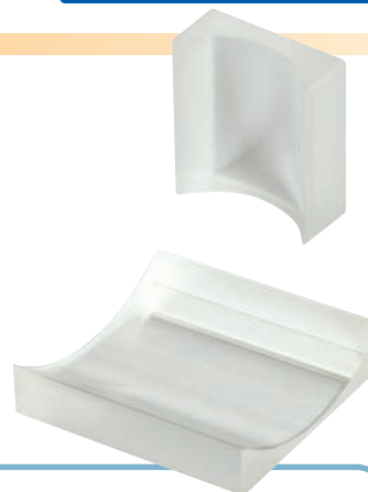
Plano-Concave Cylindrical Lens

Please refer to our website for complete models and drawings.