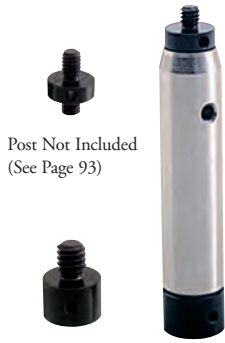
Post Not Included (See Page 93)

The Isolation Post Adapter Set is designed to be used with our Ø1/2" TR Series Mounting Posts. They are made from a high-strength plastic with a high dielectric constant. These adapters can be used to electrically isolate an instrument or optomechanical device from the rest of the setup.