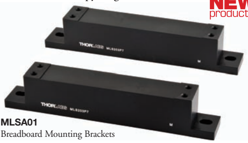
MLSA01 Breadboard Mounting Brackets