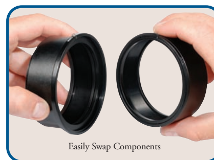
Easily Swap Components