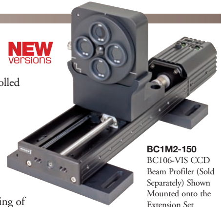
BC1M2-150 BC106-VIS CCD Beam Profiler (Sold Separately) Shown Mounted onto the Extension Set

These optional M 2 Analysis Extension Sets allow automated, motorized, computer-controlled M 2 analysis when combined with our Camera Beam Profilers (BC100 Series featured on page 1615) or Slit Beam Profilers (BP100 Series featured on page 1614). Each extension set includes the motorized translation stage as well as the necessary hardware to mount the appropriate beam profiler onto the stage. Via the RS232 connection, the translation stage is controlled by the beam profiler's M 2 software module. Alternatively, a USB port can be used with the included adapter.