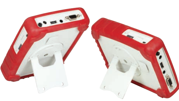
Swivel Kickstand Offers Landscape or Portrait View

If you load the spectral response curve for your broadband light source, the PM200 is capable of adjusting the responsivity at each wavelength and calculating the resulting responsivity setting that enables it to display the correct power. Similarly, you also have the ability to load a response curve for a filter, the meter will calculate the adjusted power and display the corrected value. Other features