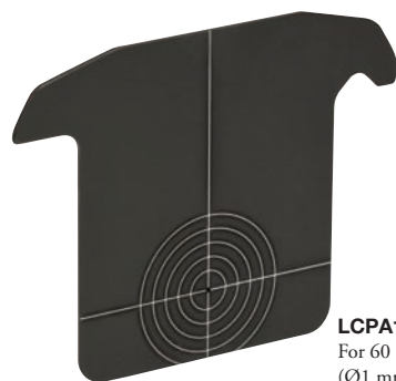
LCPA1 For 60 mm Cage (Ø1 mm Hole)