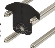
CPA2 For 30 mm Cage (Ø5 mm Hole)