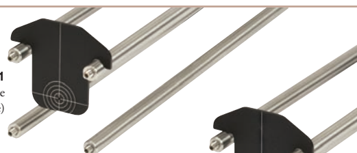
CPA1 For 30 mm Cage (Ø1 mm Hole)