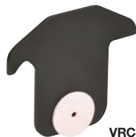
VRC4CPT For 30 mm Cage (IR Disk)