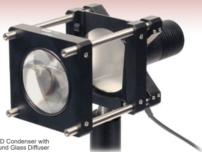
Diffused LED Condenser with Custom Ground Glass Diffuser