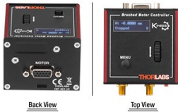
K-Cube™ DC Servo Motor Controller (Two Required)

This Motorized Pitch and Yaw Platform provides ±2.5° of adjustment in pitch and ±4.0° in yaw. It is designed for use with loads up to 2.0 kg (4.40 lbs), such as lasers, cameras, and 3-axis stages. The actual maximum load will depend on the positioning of the load on the platform (see the table to the right or the Specs tab for more details). The 112.0 mm x 115.0 mm (4.41" x 4.53") top platform is equipped with an array of 1/4"-20 (M6) threaded mounting holes on 1" (25 mm) centers.