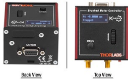
K-Cube™ DC Servo Motor Controller (Two Required)

This Motorized Pitch and Yaw Platform provides ±2.5° of adjustment in pitch and ±4.0° in yaw. It is designed for use with loads up to 2.0 kg (4.40 lbs), such as lasers, cameras, and 3-axis stages. The actual maximum load will depend on the positioning of the load on the platform (see the table to the right or the Specs tab for more details). The 112.0 mm x 115.0 mm (4.41" x 4.53") top platform is equipped with an array of 1/4"-20 (M6) threaded mounting holes on 1" (25 mm) centers.