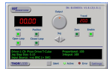
APT GUI Screen