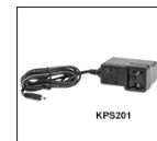
The KPS201 Power Supply Unit

The KPS201 power supply outputs +15 VDC at up to 2.66 A and can power a single K-Cube or T-Cube with a 3.5 mm jack. It plugs into a standard wall outlet.