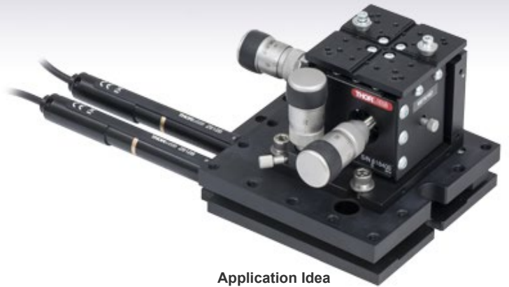
Application Idea 3-Axis Flexure Stage Mounted Directly to a PY004Z8 High-Load Pitch and Yaw Stage for High-Precision 5-Axis Control