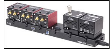
KCH601 USB Controller Hub (Sold Separately) with Installed K-Cube and T-Cube™ Modules (T-Cubes Require the KAP101 Adapter)

Thorlabs' KDC101 K-Cube Brushed DC Motor Controller provides local and computerized control of a single motor axis. It features a top-mounted control panel with a velocity wheel that supports four-speed bidirectional control with forward and reverse jogging as well as position presets. A backlit digital display is also included that can have the backlit dimmed or turned off using the top-panel menu options. The front of the unit contains two bidirectional trigger ports that can be used to read a 5 V external logic signal or output a 5 V logic signal to control external equipment. Each port can be independently configured.