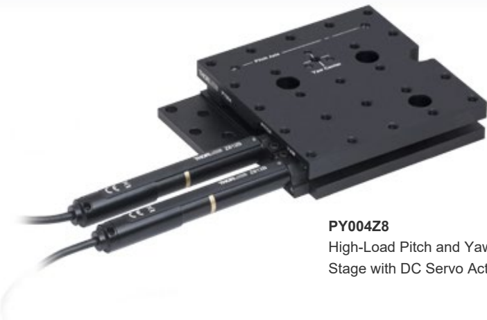
PY004Z8 High-Load Pitch and Yaw Stage with DC Servo Actuators