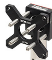
Click to Enlarge LCP6X Adapter Mounted to a Zelux ® CMOS Compact Camera for Compatibility with 60 mm Cage Components

The LCP6X Cage Plate Adapter provides a convenient means for coupling 30 mm and 60 mm cage assemblies via our Ø6 mm ER cage rods. The centered SM1-threaded (1.035"-40) hole is compatible with SM1-threaded lens tubes or Ø1" optics up to 0.08" (2 mm) thick (SM1RR retaining rings sold separately). Each cage rod through hole is accompanied by a side-located locking M4 x 0.7 setscrew that can be adjusted using a 5/64" (2 mm) hex key. These setscrews provide improved stability for attaching cage rods compared to the 4-40 setscrews used in the LCP4S cage plate adapter (sold above). Unlike the LCP33(/M) cage plate adapter, this cage plate adapter does not have a tapped hole for post mounting due to the thin profile.