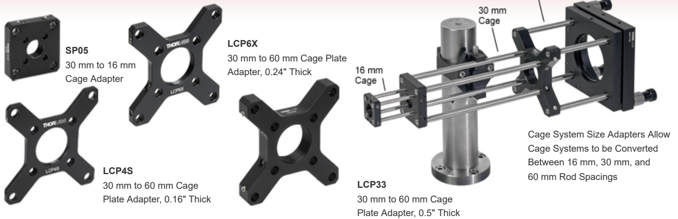
SP05 30 mm to 16 mm Cage Adapter