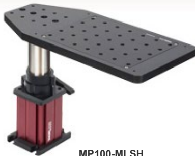
MP100-MLSH Insert Holder Shown with Breadboard Insert