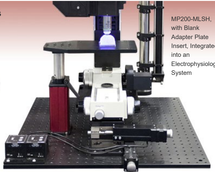
MP200-MLSH, with Blank Adapter Plate Insert, Integrated into an Electrophysiology System