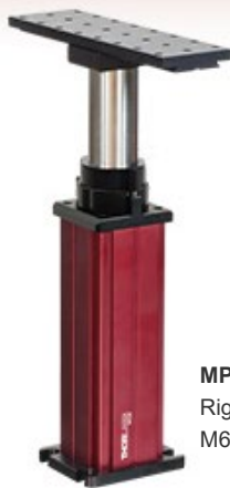
MP200 Rigid Stand with M6-Tapped Platform