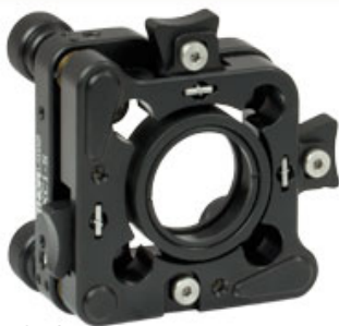
KC1-S SM1 (1.035"-40) Tap in Front Slip Plate