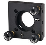
Click to Enlarge KC1 Back View

The KC1 Kinematic Mount is designed with a smooth, double-bored mounting hole that can accommodate a \varnothing 1" optic that is at least 0.12" (3 mm) thick; the optic is held in place with a top-located, nylon-tipped locking screw. This kinematic mount comes with three 1/4"-80 adjusters that offer an adjustment per revolution of 7 mrad/rev. In addition, each adjuster has independently locking setscrews.