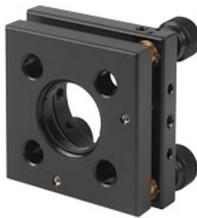
KC1-T SM1 (1.035"-40) Tap in Front Plate