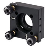
Click to Enlarge KC1-T Back View

The KC1-T and KC1T/M Kinematic Mounts are designed with an SM1-threaded (1.035"-40) mounting hole that can directly hold optics up to 5.8 mm (0.23") thick using the two included SM1RR Retaining Rings. Thicker optics can be accommodated by housing the optic in one of our SM1-Series Lens Tubes and then threading the lens tube into the front plate of the mount. Alternatively, since the back plate of each mount features an oversized \varnothing 1.32" bore, SM1 lens tubes can also be attached to the front plate from the rear of the mount without sacrificing angular adjustment. Each of the mount's three adjusters can be independently locked using a side-located 5/64" (2.0 mm) hex setscrew.