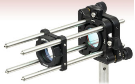
KC1-S Retroreflector Cage (Components Sold Separately)