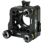
Click to Enlarge KC1-S Back View

The KC1-S Kinematic Mount is designed with a SM1 (1.035"-40) threaded mounting hole with a front slip plate that enables direct mounting of optics up to 5.8 mm (0.23") thick using the included SM1RR Retaining Rings. Thicker optics can be accommodated by housing the optic in one of our SM1-Series Lens Tubes and then threading the lens tube into the front plate of the mount. Alternatively, since the back plate of the KC1-S Kinematic Mount features an oversized \varnothing 1.32 " bore, SM1 lens tubes can also be attached to the front plate from the rear of the mount without sacrificing angular adjustment. This threaded, kinematic mount comes with three adjusters with independently locking setscrews.