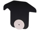
Back View of VRC4CPT

The CPA1 and CPA2 Alignment Plates are convenient tools for aligning cage-based optical systems. These drop-in plates feature a small through hole at the exact center of the 30 mm cage assembly that is used for aligning visible beams. For easy alignment, the through hole is surrounded by engraved rings, which indicate \varnothing 4 mm, \varnothing 7 mm, \varnothing 10 mm, and \varnothing 13 mm. The CPA1 provides a \varnothing 0.9 mm through hole, while the CPA2 provides a \varnothing 5 mm through hole.