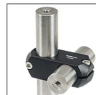
Click to Enlarge Two Ø1" Posts Mounted Orthogonally Using the RSA90 Clamp

Thorlabs' RSA90(M) Right-Angle Clamp allows one Ø1" (25.0 mm) post to be mounted perpendicularly to another Ø1" (25.0 mm) post. The clamp features a highly stable flexure lock design that is secured using a 3/16" (5 mm) balldriver. The center-to-center distance between the two posts is 1.25" for the imperial version and 30.0 mm for the metric version.