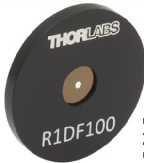
R1DF100 Annular Aperture Target Obstruction Diameter = 100 \mu\text{m} Pinhole Diameter = 1000 \mu\text{m}

Application Idea R1CA2000 Obstruction Target Mounted in a CXY1Q Translation Mount with Quick-Release Plate