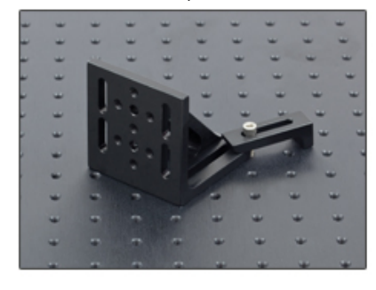
MSCL3 Table Clamp