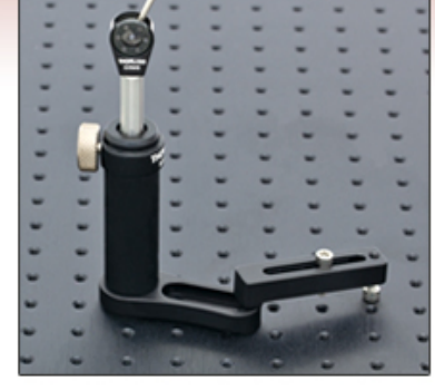
MSCL2 Table Clamp