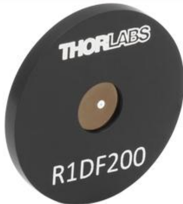
R1DF200 Annular Aperture Target Obstruction Diameter = 200 \mu\text{m} Pinhole Diameter = 1000 \mu\text{m}

Application Ideas R1CA2000 Obstruction Target Mounted in CXY1Q Translation Mount with Quick-Release Plate