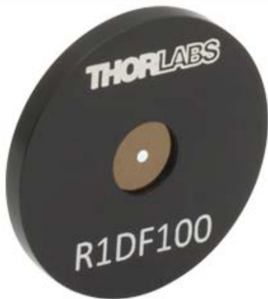
R1DF100 Annular Aperture Target Obstruction Diameter = 100 \mu\text{m} Pinhole Diameter = 1000 \mu\text{m}

Application Ideas R1CA2000 Obstruction Target Mounted in CXY1Q Translation Mount with Quick-Release Plate