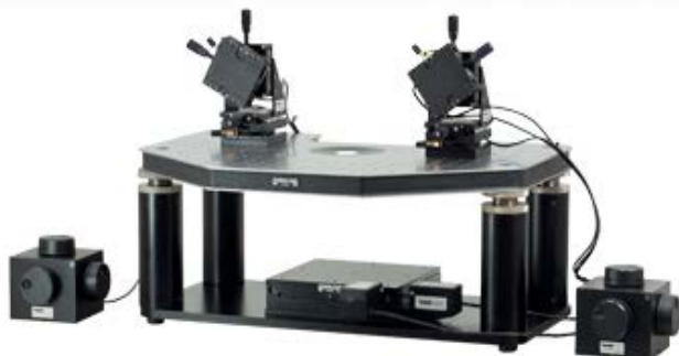
Two PCS-5400 Micromanipulators Mounted on Our Gibraltar GMHB-BX Platform