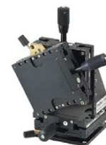
Click to Enlarge Micromanipulator Assembly

The headstage pivot allows for simple optimization of the pipette angle of approach on either an inverted or upright microscope. Additionally, the PCS-500-SSH Steep/Shallow Headstage Adapter or MIS-PHM Pipette Holder may be used in applications requiring very steep or shallow angles. Due to the symmetric design of our micromanipulator assembly, this system can be easily modified for a left-sided or orthogonal approach axis without needing a special adapter kit.