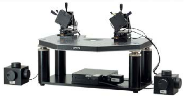
Two PCS-5400 Micromanipulators Mounted on Our Gibraltar GMHB-BX Platform