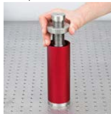
Click to Enlarge Step 3: Lower the red cover, ensuring the dowel pins in the base are aligned with the holes in the cover. Adjust the post to the desired height, and then lower the locking ring to lock the height.