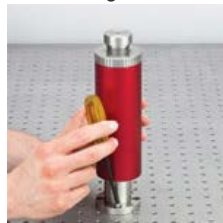
Click to Enlarge Step 2: Raise the red cover and attach the post base to the table.