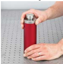
Click to Enlarge Step 1: Loosen the Locking collar, and raise the threaded portion of the post.

The PHY12P/(M) Adjustable-Height Support Columns are designed to support a breadboard or microscope stage. Each post has a top-located 1/4"- 20 (M6) tap and a universal base that has four 1/4" (M6) counterbored holes on 2" (50 mm) centers for mounting it to an optical table or optical breadboard. The height of the post is continuously adjustable from 8" to 12", and its position can be locked using a knurled ring locking collar. To secure the columns to an optical table is as simple as loosening the locking collar and raising the red housing. This will provide access to the four counterboard 1/4" (M6) mounting holes.