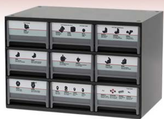
ESK17 Ø1/2" Optical Mounts Kit