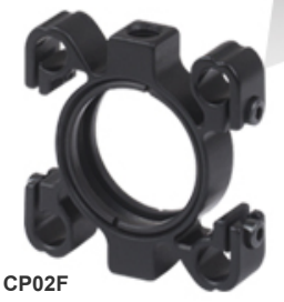
SM1-Threaded Dual Flexure Cage Plate

The CP02F Cage Plate's flexure arm automatically compensates for cage rod misalignment to preve cage plate binding.