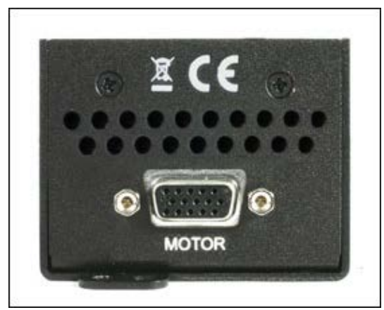
TDC001 Rear Panel

Thorlabs' T-Cube controllers are members of the apt<sup>™</sup> family of controllers which includes a range of high specification motor and piezo controllers (both in benchtop and rack-based formats) specifically aimed at high resolution positioning applications. By inheriting much of the functionality developed for these high end variants, the T-Cube drivers are built on a flexible and powerful motion control capability with full and complete software support. It is perfectly feasible to mix operation of the TDC001 T-Cube unit with any other member of the apt<sup>™</sup> controller family through the same unified software interfaces, both graphical and programmable. For the first time, positioning and motion control applications deploying any of the complete range of Thorlabs motorized/piezo actuated nano-positioning and opto-mechanical hardware is easily achieved in minimum time via a common PC software platform.