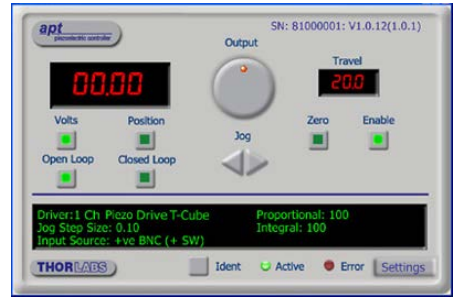
APT GUI Screen

By providing these common software platforms, Thorlabs has ensured that users can easily mix and match any of the APT controllers in a single application, while only having to learn a single set of software tools. In this way, it is perfectly feasible to combine any of the controllers from the low-powered, single-axis to the high-powered, multi-axis systems and control all from a single, PC-based unified software interface.