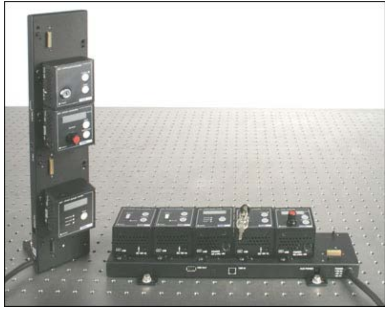
Vertical and Horizontal Mounting Options

As a further level of convenience when using the T-Cube Controllers Thorlabs also offers the T-Cube Controller Hub. This product has been designed specifically with multiple T-Cube operation in mind in order to simplify issues such as cable management, power supply routing, multiple USB device communications and different optical table mounting scenarios. The T-Cube Controller Hub comprises a slim base-plate type carrier [375 mm x 86 mm x 21.5 mm (14.75" x 3.4" x 0.85")] with electrical connections located on the upper surface to accept up to six T-Cubes. Internally the Controller Hub contains a fully compliant USB 2.0 hub circuit to provide communications for all six T-Cubes - a single USB connection to the Controller Hub is all that is required for PC control. The Controller Hub also provides power distribution for up to six T-Cubes, and alsor outes digital and analog signals between T-Cubes allowing deterministic inter-Cube operation in certain applications.