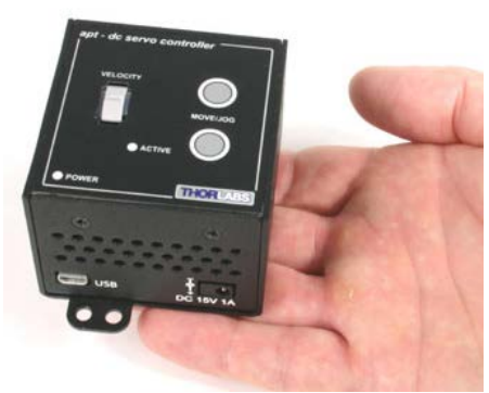
TDC001 DC Servo Driver T-Cube