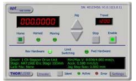
TDC001 Software GUI

control panels, allowing motor moves to be initiated and monitored very easily. All motor operating parameters can be easily accessed and changed "on the fly" during motor moves in order to fine tune operation as required. Multiple graphical panels displayed within the software allow control of multiple T-Cube drivers simultaneously in an easy and intuitive way.