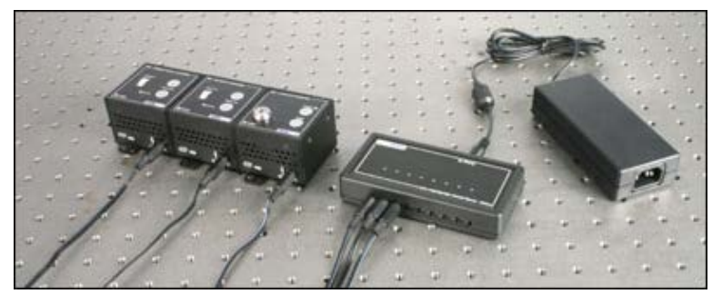
TPS008 Power Supply

Note: when operating the TDC001 T-Cube standalone (in absence of the TCH002 Hub) a separate power supply is required. Compatible power supply options are listed below.