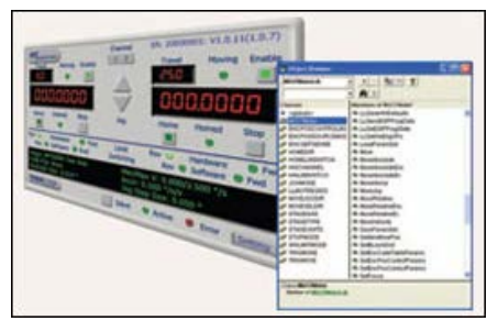
Typical ActiveX Control View

A full and sophisticated software suite is supplied with the TDC001. It comprises a number of 'out of the box' user utilities to allow immediate operation of the unit without any detailed pre-configuration. All operating modes can be accessed manually and all operating parameters changed and saved for next time use. For more advanced 'custom' motion control applications a fully featured ActiveX® programming environment is also included to facilitate custom application development in a wide range of programming environments. Note that all such settings and parameters described above are also accessible through these ActiveX® programmable interfaces. For further information on the apt<sup>TM</sup> software support for the T-Cube drivers refer to the Software tab. Demonstraton videos illustrating how to program the apt<sup>TM</sup> software are also available for viewing from the Video Tutorial tab.