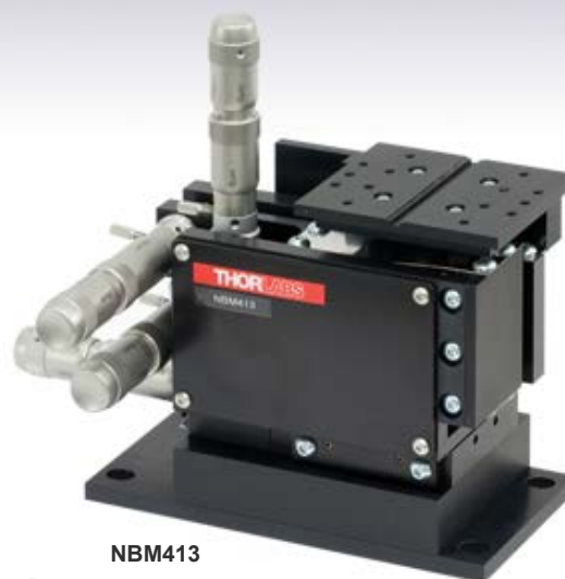
NBM413 Patent 6,186,016