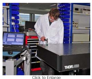
Click to Enlarge Nexus Table Compliance Testing

compliance curve to represent the entire product line. The compliance curves and data published by Thorlabs are from sensors located on the corner of the table and therefore represent the worst case data.