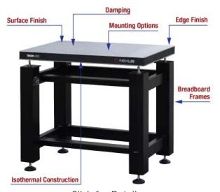
Click for Details 2' x 3' Nexus Breadboard Mounted on a PFR6090-8 Rigid Breadboard Frame