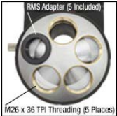
Adjustment Knobs Five-Objective Turret

The focus block includes a built-in five-objective turret with M26 x 36 TPI (M26 x 0.706) threading. In order to allow direct mounting of RMS-threaded objectives, the focus block ships with five RMSA7 adapters. A selection of adapters for the commonly used M25 x 0.75 and SM1 (1.035"-40) threads is shown below, but Thorlabs manufactures many other adapters as well.