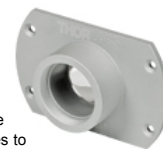
LED4B1 Adapter to Couple Liquid Light Guides to the 4-Wavelength Source