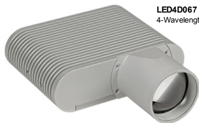
LED4D067 4-Wavelength High-Power LED Source