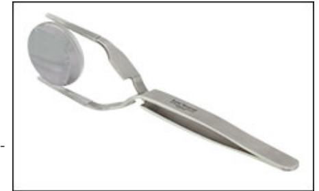
Click to Enlarge TZ3 Self-Closing Tweezers Holding a Ø1" Lens

Thorlabs offers three types of tweezers for the handling of delicate optics. Our TZ1 tweezers work well for holding the edges of Ø12 mm or smaller optics. These tweezers are made from stainless steel and have molded-carbon-fiber tips to protect the object being handled. Alternatively, our TZ2 tweezers can accommodate Ø25.4 mm or smaller optics and are made from nylon that is chemically resistant to common lab solvents. Finally, our TZ3 self-closing tweezers are able to comfortably hold the edges of Ø12 mm to Ø25.4 mm optics, as shown in the photo to the right. The TZ3 tweezers have a polyolefin cover over each tip that is unaffected by common lab solvents and helps to grip and protect optics.