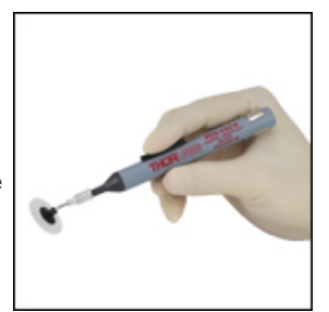
Click to Enlarge VP10C Vacuum Pick-Up Tool Holding a Ø1" Lens

The VP10C Vacuum Pick-Up Tool Kit is ideal for lifting and handling small optics, such as lenses and mirrors, without damaging the optic. This pick-up tool is shaped like a pen for ease of use and also includes a pen clip for carrying. Each kit comes with a set of five angled and five straight interchangeable tips with \emptyset 1/8", \emptyset 1/4", \emptyset 3/16", \emptyset 3/8" or \emptyset 1/2" Buna-N (nitrile) suction cups. Hold and then let go of the black button while contacting an optic with a suction cup to apply the vacuum force; press the black button to release the optic.