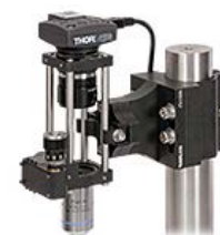
Click to Enlarge 30 mm Cage System Vertically Mounted on a Ø1.5" Post Using a CV1526 Clamp

Custom CV1526(M) Clamp Mounts can be ordered for 16 and 60 mm cage system compatibility. Please contact Tech Support for more information.