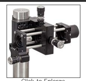
Click to Enlarge A spatial filter can be mounted to a Ø1.5" post using the #8 (M4) counterbores on the C1511(/M) Post Clamp.

The C1511 (shown on the left attached to a Ø1.5" Post) offers a removable front plate that provides an array of 1/4"-20 (M6) and 8-32 (M4) tapped and counterbored holes. This removable mounting plate can be purchased separately as C1520 (C1520/M) below.