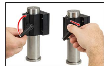
Click for Details

Left: Handle Being Attached to the C1501 Post Mounting Clamp