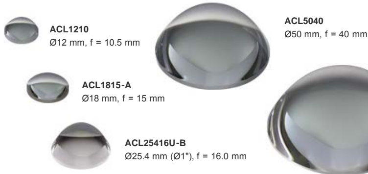
ACL7560-A Ø75 mm, f = 60 mm