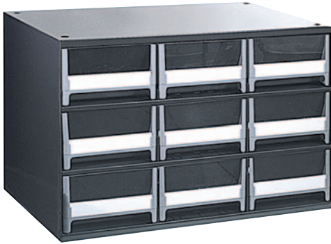
S19909 9-Drawer Cabinet: 11" x 17" x 11" Drawer Size: 5.2" x 3.1" x 10.6"