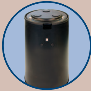
Rigid Isolation Supports Available, See Page 63

Thorlabs offers a broad range of tables and vibration isolation systems that enable the selection of the appropriate components for any application and environment. The chart on page 41 will assist you in making an appropriate choice. If you should need further assistance, our application engineers are available to help you.