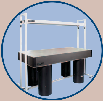
Enclosures and accessories available, see pages 58-59

Thorlabs offers a broad range of tables and vibration isolation systems that enable the selection of the appropriate components for any application and environment. The chart on page 41 will assist you in making an appropriate choice. If you should need further assistance, our application engineers are available to help you. Call us at 973-579-7227, and ask for technical support.